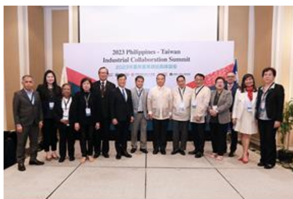
A group photo for 2023 Philippines-Taiwan Industrial Collaboration Summit on November 23, 2023. Mr. Chen Chern-Chyi, Deputy Minister of Economic Affairs (left 6).