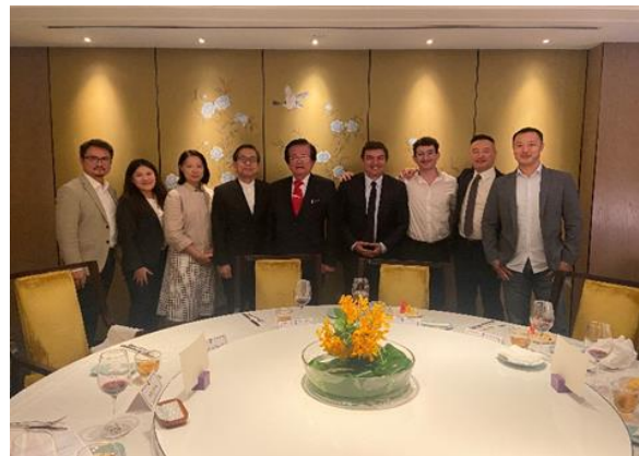
A group photo of a welcome luncheon for VIP guests from Argentina.

trade cooperation. Some Taiwanese manufacturers who had gone to Argentina for inspection suggested that “they have already contacted Argentine manufacturers and will import to Taiwan such competitive products as red wine, frozen seafood, olive oil, etc. to enhance the economic and trade ties between Taiwan and Argentina.”